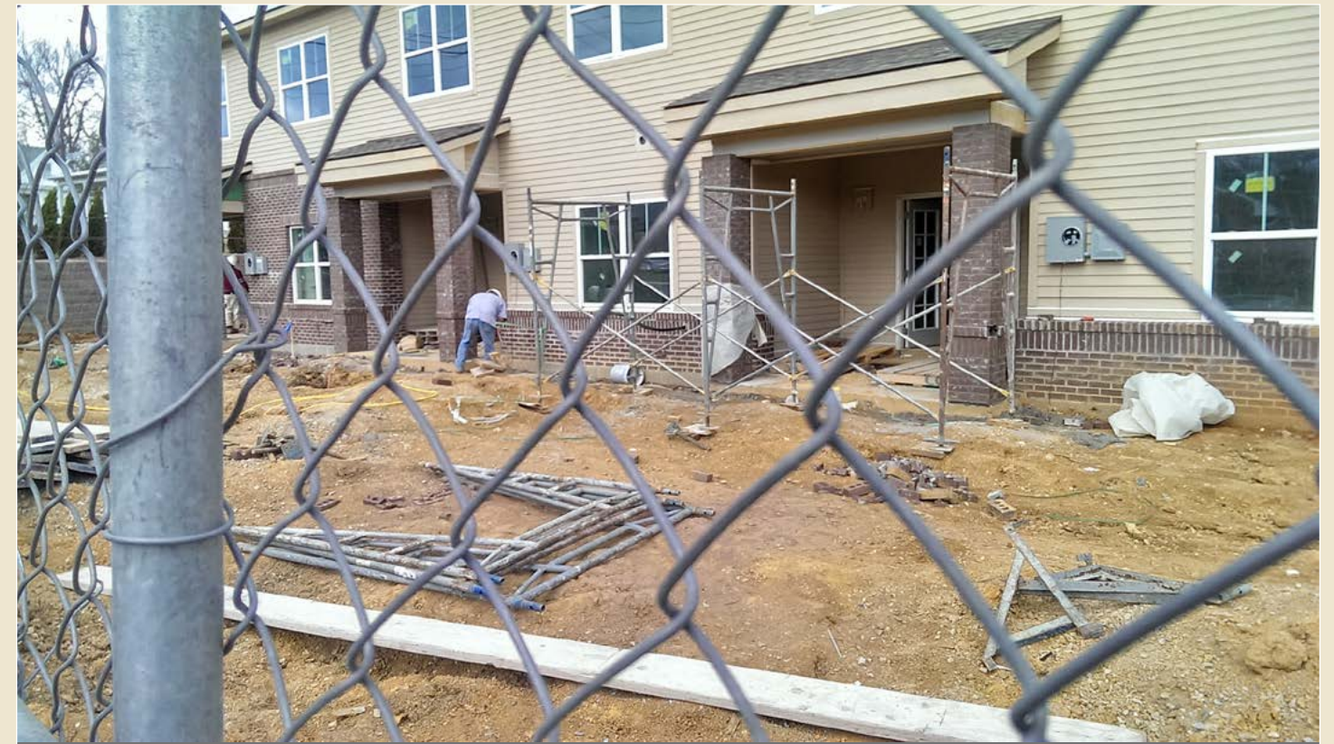
After construction this area will be planted with trees, shrubs, and turf. Heavy grading and a confined building site have resulted in severe soil compaction that is a prime candidate for SPR.

increase growth rates, improve soil permeability for stormwater management, increase soil carbon stores, and help meet soil restoration requirements for projects seeking SITES certification (Sustainable Sites Initiative, sustainable-sites.org ). Urban foresters can use SPR to rehabilitate soils damaged by construction and development and set them on the path to long-term recovery. The procedure is relatively simple—deep mixing of high quality compost with existing soil followed by planting trees or shrubs.