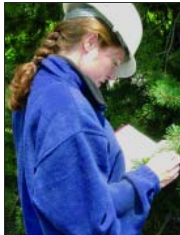
Figure 3. Monitoring is a program of regular landscape inspections, which is a critical component of landscape IPM.

Site information is valuable for the diagnosis and treatment of landscape pest problems. Valuable site information includes recent weather patterns, landscape cultural practices (including management of other vegetative components), additions/ removals of neighboring plant material, and hardscape construction/ repair.