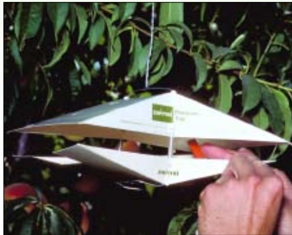
Figure 4. Pheromone-baited insect traps are used to monitor pest abundance and life stage, evaluate action thresholds, and properly time control tactics.

Sometimes it is difficult to evaluate a pest problem based solely on visual inspection of the landscape. The pest may only be active at certain times (such as the black vine weevil at night), or current damage levels may provide insufficient information to guide management decisions. In addition, some pests can only be controlled during a specific life stage that is difficult to detect (as with clearwing moths). In these circumstances, trapping devices should be used to monitor pest abundance and life stage, to evaluate action thresholds, and to properly time control tactics (Figure 4). Trapping devices are commercially available for various insect pests.