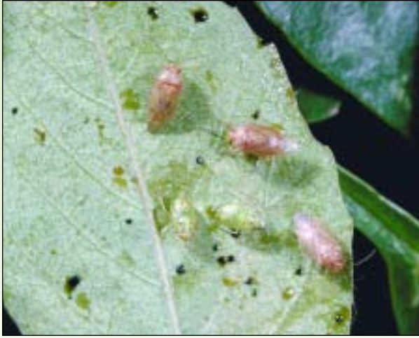
Figure 2. A pest becomes a problem when its population or the injury it causes exceeds a tolerable level known as an action threshold (ash plant bug adults, nymphs, and fecal drops pictured).

diminish personal enjoyment, comfort, or safety in the landscape. Such pests are managed using a population action threshold, the population level above which personal comfort or landscape quality is diminished. When the pest population exceeds this action threshold, control measures are considered.